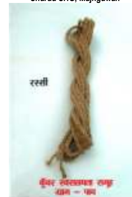
Jute Rope Kunwar SHG, Paye