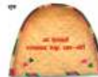
Soopa Jai Sherawali SHG, Khairee