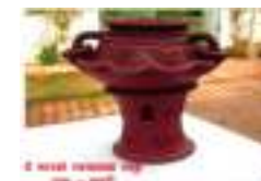
Terracotta Decorative Om Bhagwati SHG, Bamhari