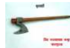
Axe Shiv SHG, Pahrapurwa