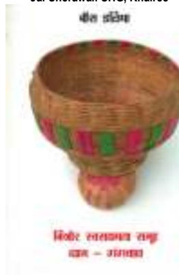
Bamboo Basket Kishore SHG, Gangwaha