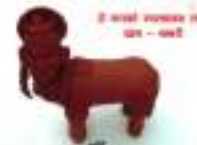
Terracotta Decorative Om Bhagwati SHG, Bamhari