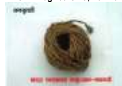
Sutti Rope Sharda SHG, Majhguan